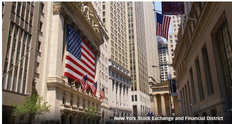
New York Stock Exchange and Financial District

Your job preparation will include a full range of professional career development activities, including résumé preparation and critique, mock interviews and presentation skills, of which you can take advantage starting in your freshman year.