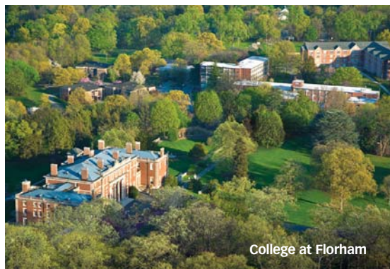
College at Florham