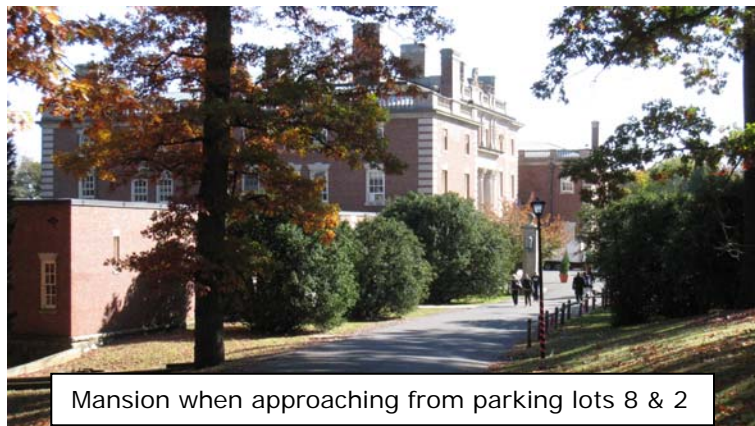
Mansion [Hennessy Hall]