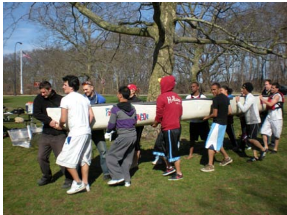
FDU students with their canoe at the 2009 Concrete Canoe Competition