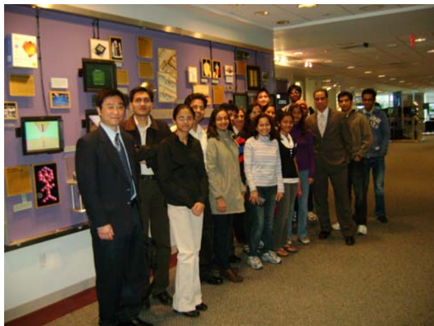
FDU computer science students and faculty touring IBM Research Center