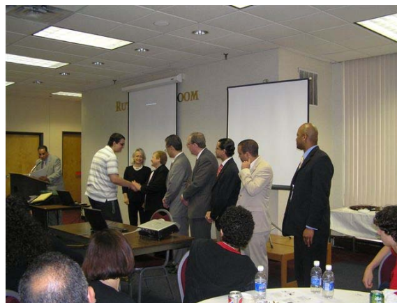
Honoring students and teachers at the TEOP Graduation Ceremony