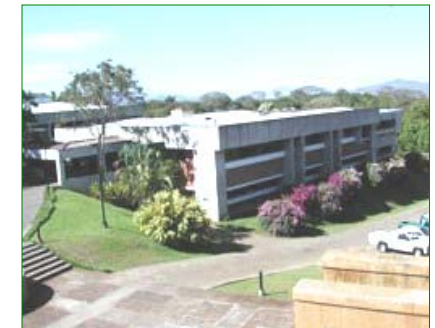
INCAE Business School Costa Rica

From Top Business Schools Fairleigh Dickinson University & INCAE Business School