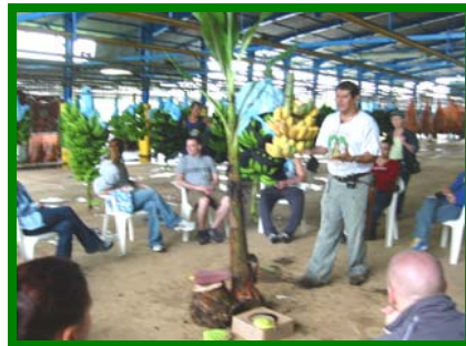
Presentation at Costa Rican Banana Plantation